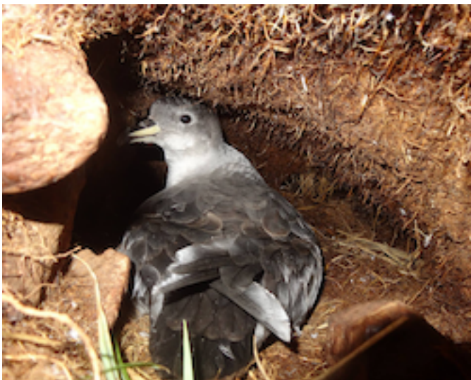
Grey Petrel