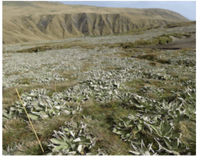
Pleurophyllum bookeri now recovering

species will respond the same and at the same rate.