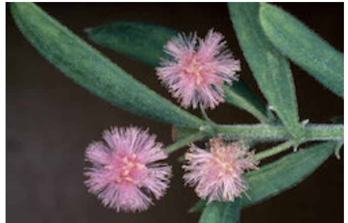
Acacia purpureopetala close-up

Image: http://worldwidewattle.com/imagegallery/image.php?p=0&l=p&id=20588&o=4