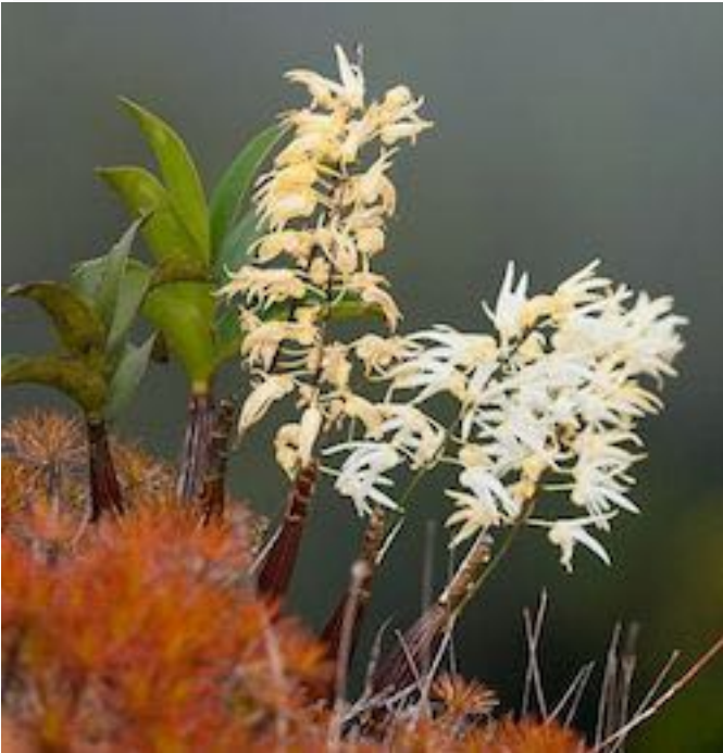
PHOTO: The Wet Tropics in Far North Queensland could become a climate refuge for the Australian rock orchid.

http://www.abc.net.au/news/2017-10-31/climate-change-threatens-australian-rock-orchid/9103394