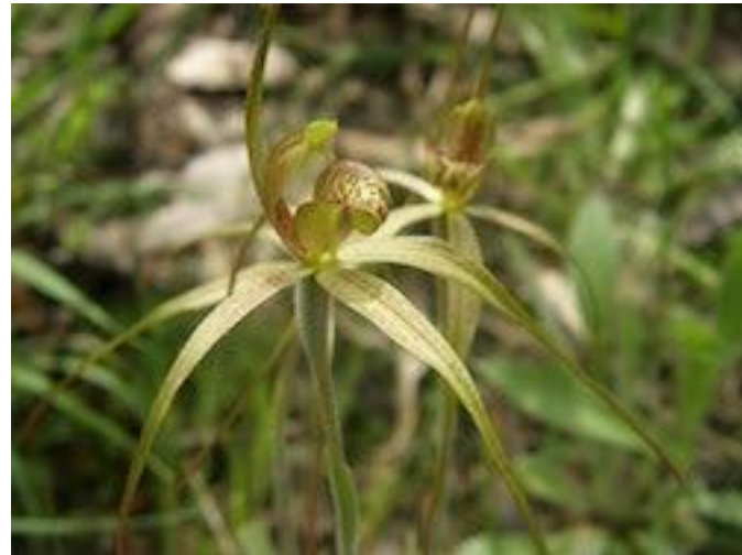
Caladenia audasii