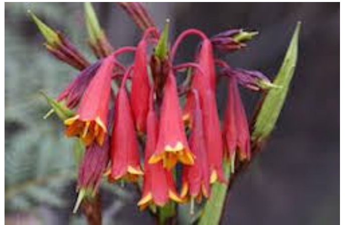
Blandfordia punicea - Tasmanian Christmas Bells

Your privacy is respected and assured with this group. You may unsubscribe at any time.