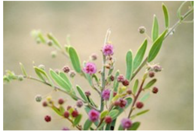
Acacia purpureopetala in flower

We're also evaluating the plant's responses to disturbances and threats to long-term population stability. We'll use DNA analysis to understand the species genetic variation across its range and undertake a seed germination trial to assess the propagation requirements of this rare species.